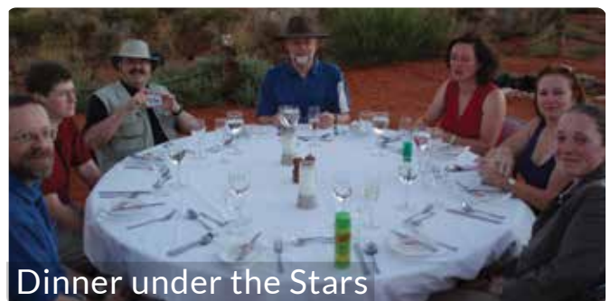
Dinner under the Stars

In the evening we will travel into the desert to see sunset on Uluru and to enjoy Dinner Under the Stars. This award-winning event is always memorable!