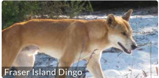
Fraser Island Dingo

On our second day you are free to enjoy the comfort and beauty of the resort, relax by the pool, take one of the many bush or beach walks, take a guided kayak tour or join one of the numerous ranger-guided