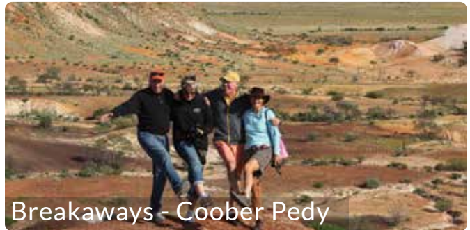
Breakaways - Coober Pedy

After the tour we suggest visiting the town's many opal shops. For selection and price, this is the best place on the trip to buy your opals.