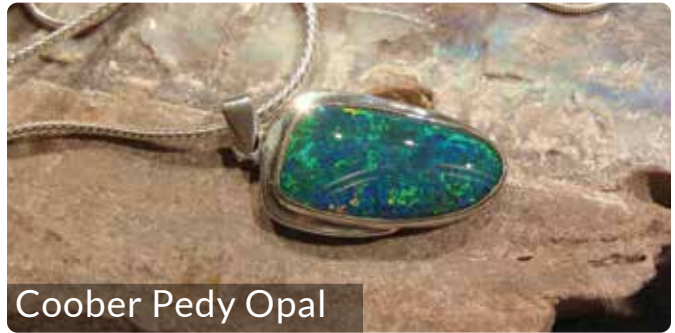
Coober Pedy Opal

As we arrive at Coober Pedy you will see thousands of holes surrounding the town – a result of the opal mining and opal jewellery industry for which the town